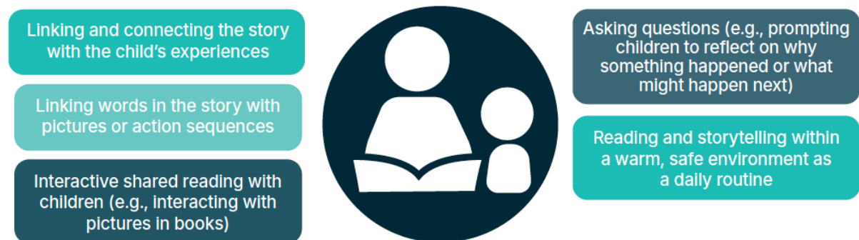
Figure 2. Reading activities that can facilitate language development in infants and children.

Shared reading is also linked to benefits beyond language development. The Growing Up in New Zealand study has found that children who read together with a parent throughout childhood were more likely to report positive childhood experiences and greater family support at age 11. 42