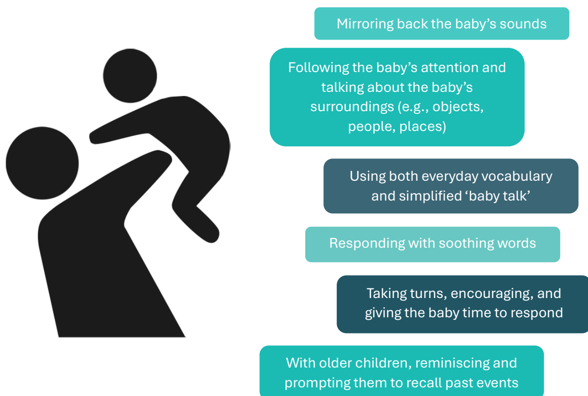
Figure 1. Ways to talk with infants and children that can facilitate their language development.

verbally, where the caregiver waits and encourages a response while maintaining eye contact. 10,31